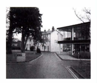
Research Centre and Berkshire Record Office